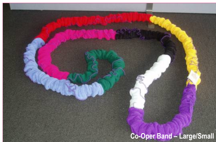
Co-Oper Band – Large/Small